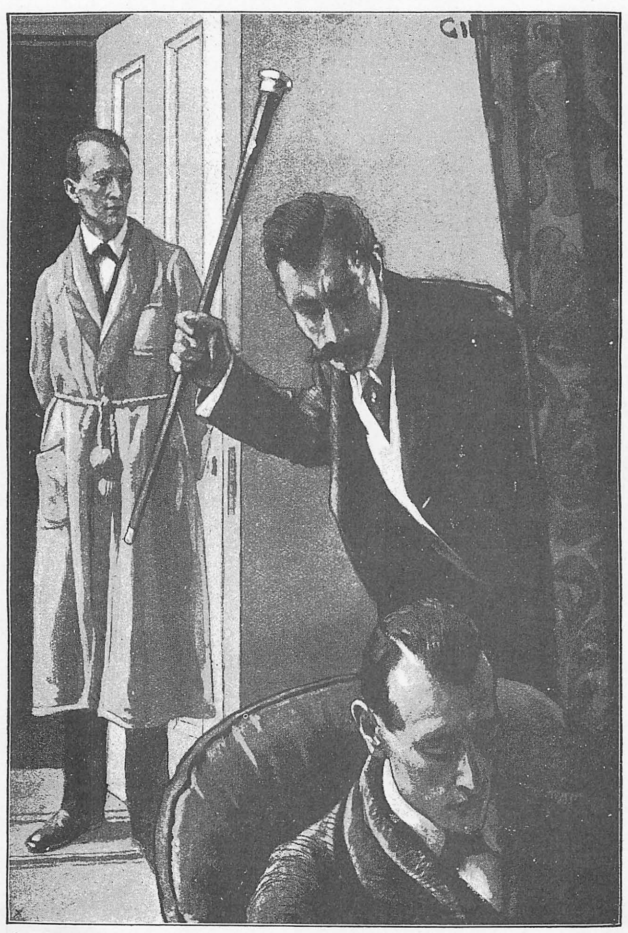
"HIS THICK STICK HALF RAISED, HE WAS CROUCHING FOR HIS FINAL SPRING AND BLOW WHEN A COOL, SARDONIC VOICE GREETED HIM FROM THE OPEN BEDROOM DOOR; 'DON'T BREAK IT, COUNT! DON'T BREAK IT!"