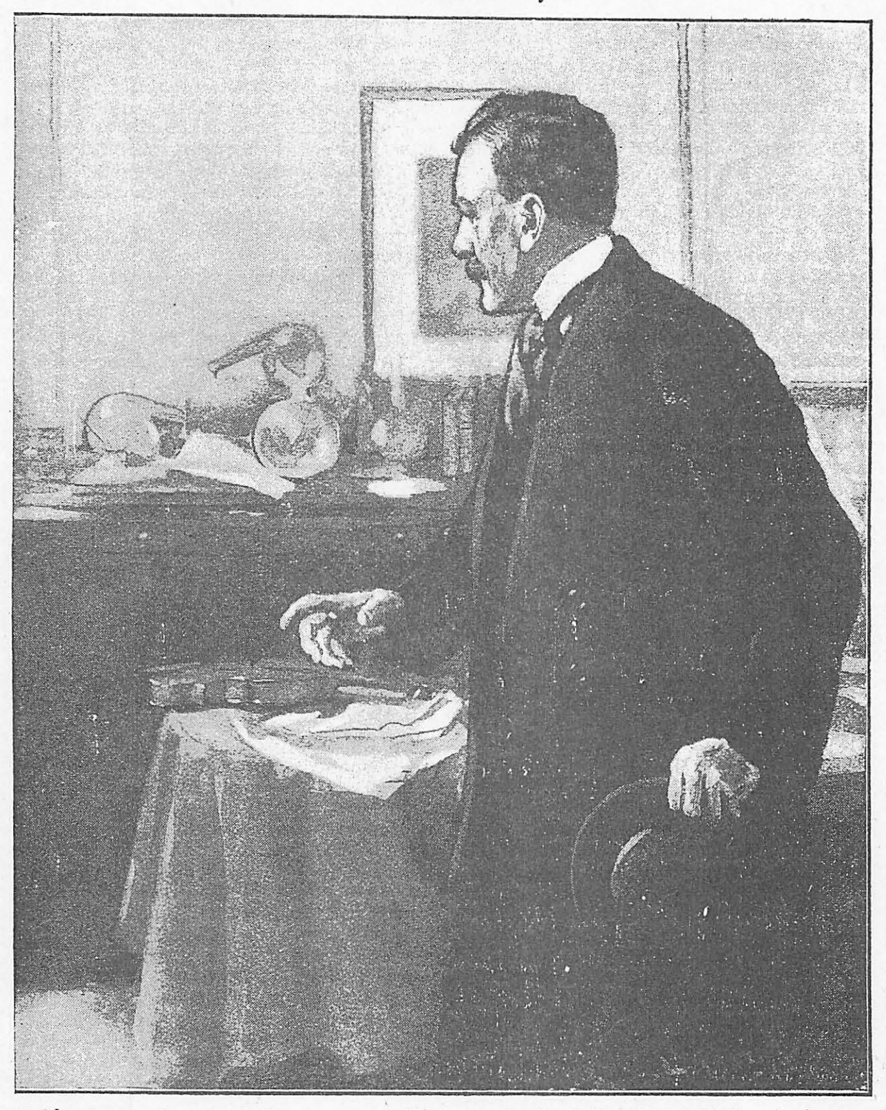
could not restrain a cry of amazement. There was a facsimile of his old friend, dressingand all."

that, with my routine of work, I should find myself on familiar terms with half the rogues' gallery, and you will agree that exceptions are invidious."